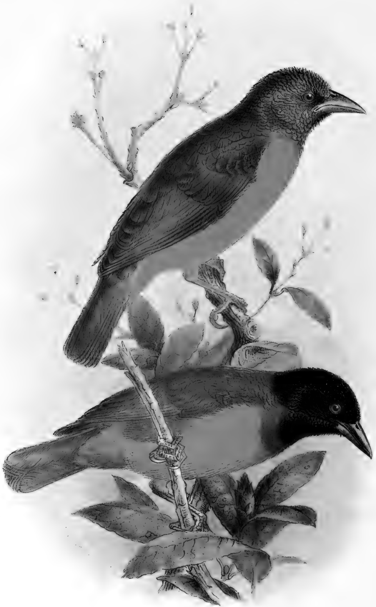
Lycobrotus stictifrons Sitta alina .